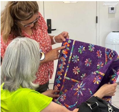
Antelope Valley Quilt Association