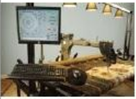
Statler Stitcher Computerized Longarm Quilting Machine