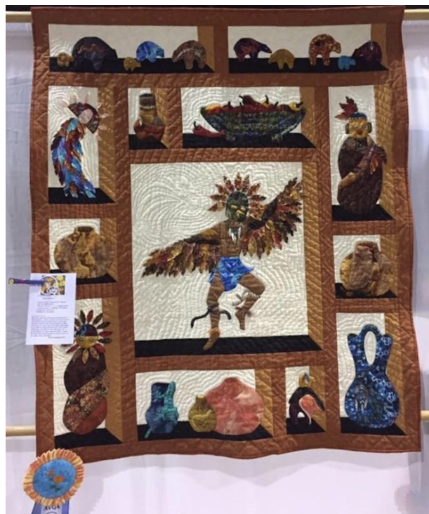
Earth Spirit by Antoinette Pappas won Viewer's Choice.