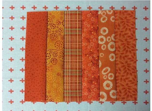
Think Fall when you select your strips!