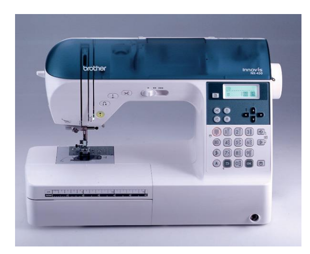
Actual machine not pictured.

Missing the original box. Retail price approximately $800.