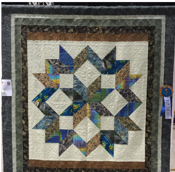
Frances Hariq's Judge's Choice - Carpenter's Star

Some of those more technical aspects of the construction of a quilt that can result in a winning quilt are: does the batting completely fill the binding evenly all around the quilt; is the binding the same width on the front of the quilt as on the