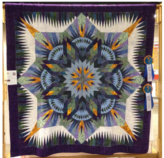
Ku'ulei's Best in Show Quilt – Prairie Star