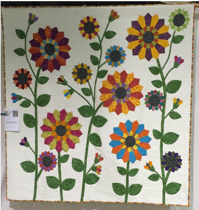
Eve Hall Viewer's Choice – Sunflower Garden