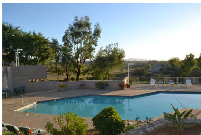
VINA DE LESTONNAC

http://www.lestonnacretreatcenters.com/vina-de-lestonnac-retreat-center/