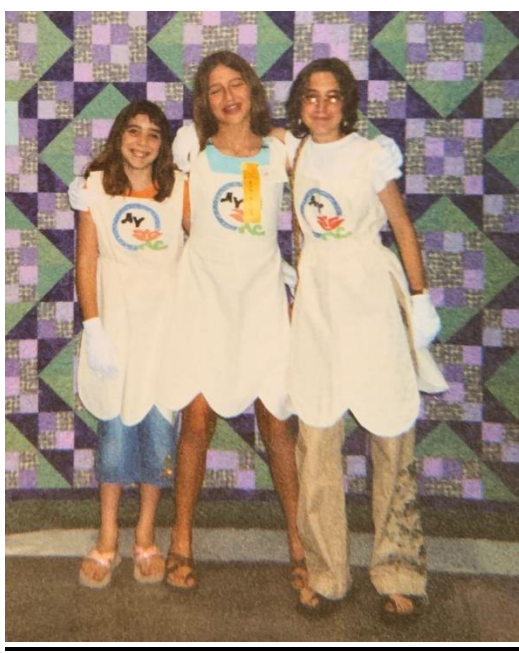
AVQA "White Glove" from 18-19 yrs ago

hands free presser foot, 9 feet included, automatic needle threader, and automatic bobbin winder. The guild is selling tickets – tickets packet is 24 tickets for $20, 6 tickets for $5, or a ticket for $1.